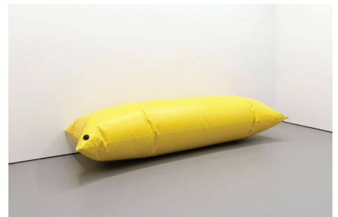
VF(343) , 2026 acrylic on dunnage bag 23 x 96 x 23 in.