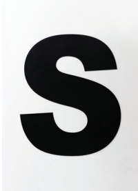
DA(S) , 2026 adhesive backed rubber 18.25 x 16 in.

Met him pike hoses 1500 S Western Ave #407 Chicago, IL 60608