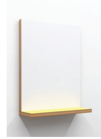
BwH(BW)(CY) , 2026 Formica on MR50 with neodymium magnets and demonstrable objects 20 x 16 x 5 in.