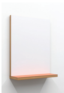
BwH(BW)(C) , 2026 Formica on MR50 with neodymium magnets and demonstrable objects 20 x 16 x 5 in.