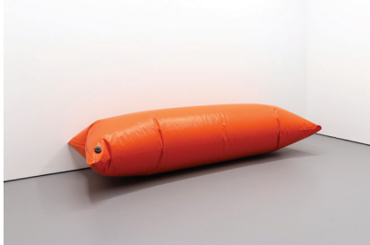
VF(2014-10) , 2026 acrylic on dunnage bag 23 x 96 x 23 in.

Met him pike hoses 1500 S Western Ave #407 Chicago, IL 60608