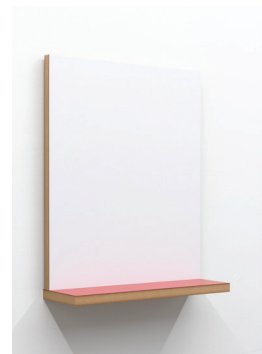
BwH(BW)(SR) , 2026 Formica on MR50 with neodymium magnets and demonstrable objects 20 x 16 x 5 in.