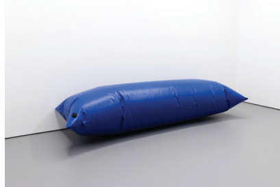
VF(2066-20) , 2026 acrylic on dunnage bag 23 x 96 x 23 in.