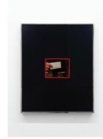
IMG_7828(SR)(N) , 2026 archival pigment print, Formica, mirror polished aluminum frame 20 x 16 in.