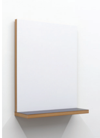
BwH(BW)(N) , 2026 Formica on MR50 with neodymium magnets and demonstrable objects 20 x 16 x 5 in.