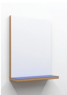
BwH(BW)(SB) , 2026 Formica on MR50 with neodymium magnets and demonstrable objects 20 x 16 x 5 in.