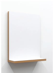
BwH(BW)(BW) , 2026 Formica on MR50 with neodymium magnets and demonstrable objects 20 x 16 x 5 in.